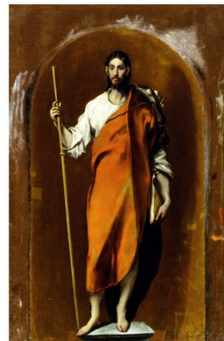
Saint James the Greater

Please contact individual parishes for details.