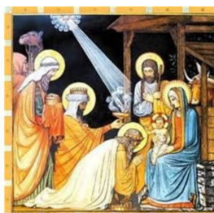
THE EPIPHANY OF THE LORD

Our junior retreat will be held Friday, January 20-Sunday, January 22 at Mt. St. Francis in Indiana! The early application fee has already passed but there is still time to apply!!