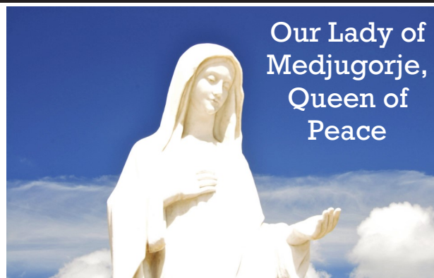
Our Lady of Medjugorje, Queen of Peace

TUESDAYS * 6:30PM * UPSTAIRS AT ST JAMES SCHOOL COME ONCE OR COME WEEKLY