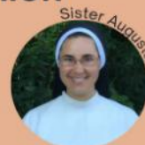
Director of Faith Formation arickel@stjames-etown.org

Open to any family with a child age 7 and over who is ready to prepare for the Sacraments of Confession & Eucharist.