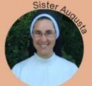
Director of Faith Formation anickel@stjames-etown.org

Open to any family with a child age 7 and over who is ready to prepare for the Sacraments of Confession & Eucharist.