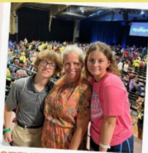
STEBENVILLE YOUTH CONFERENCE